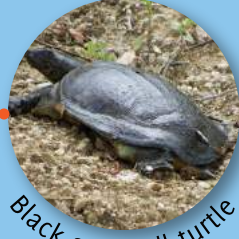
Black softshell turtle

No reasonable doubt last individual has died